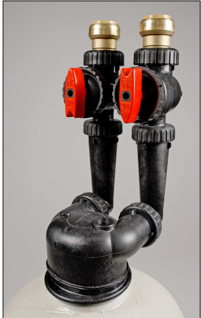
1191 In-Out Head shown with optional V3191-01 Vertical 90° Adapter Kit, V3006 Bypass Assembly and V3007-13 1" SharkBite® Fittings