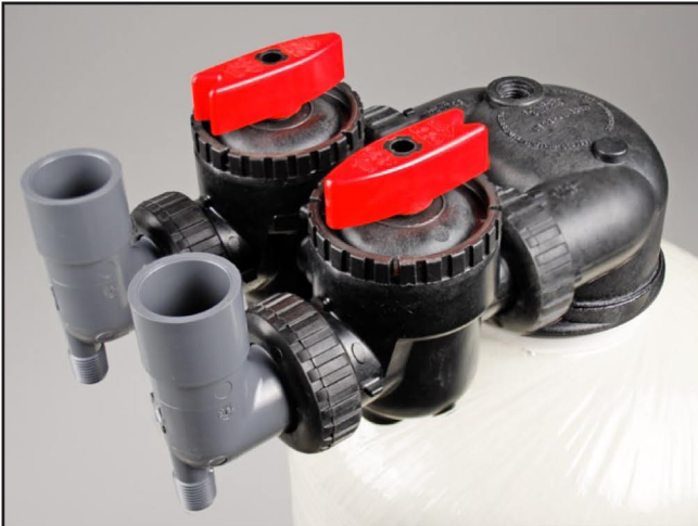
1191 In-Out Head shown with optional V3006 Bypass Assembly and V3007-01 3/4" x 1" PVC Solvent Elbow Assembly